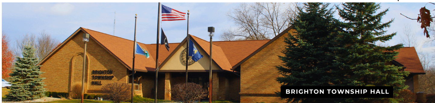
BRIGHTON TOWNSHIP HALL